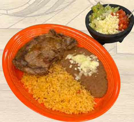
*STEAK TAMPIQUEÑO Grilled beef steak served with rice, beans, tortillas and a guacamole salad. Cash - 22.00 Card - 22.88