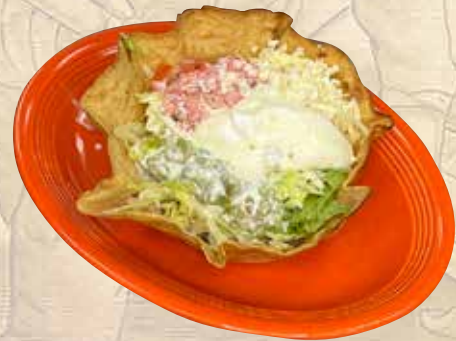
FAJITA TACO SALAD Grilled chicken or steak with vegetables served in a deep-fried flour tortilla. Topped with lettuce, sour cream, guacamole, tomatoes and cheese. Chicken or Steak Small: Cash - 9.50 Card - 9.88 Large: Cash - 11.50 Card - 11.96 Shrimp Cash - 13.50 Card - 14.04

ANY SUBSTITUTIONS OF RED SALSA FOR CHEESE DIP OR EXTRA CHEESE DIP: CASH + 1.50 CARD + 1.56