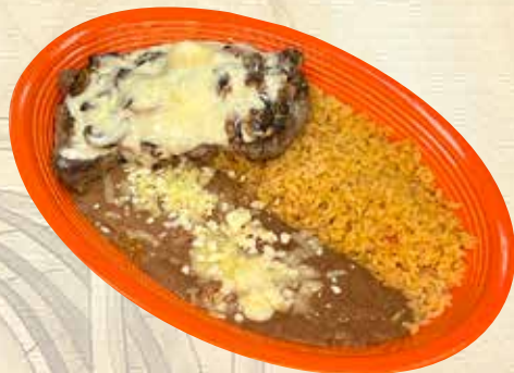
*STEAK CON QUESO Grilled beef steak covered with mushrooms and cheese. Served with rice, beans and tortillas. Cash - 23.00 Card - 23.92