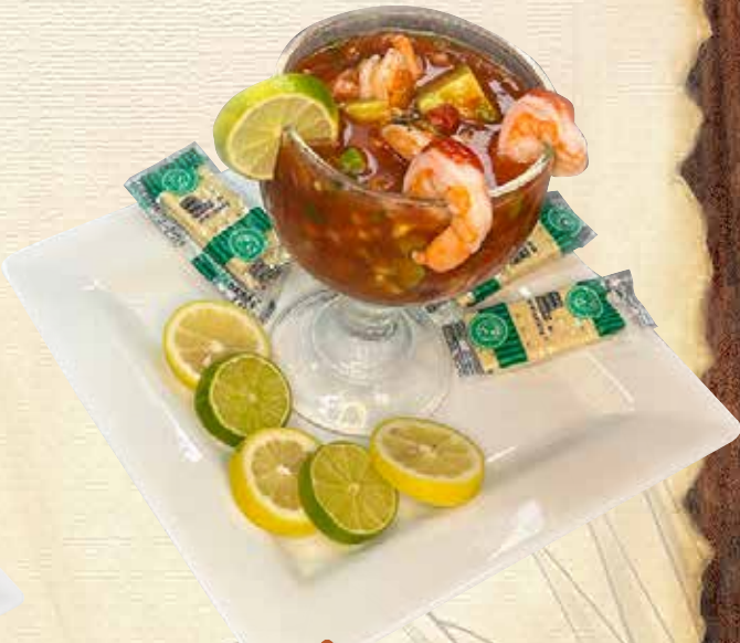
CÓCTEL DE CAMARÓN A chilled Mexican seafood cocktail made with shrimp. Cash - 14.99 Card - 15.58