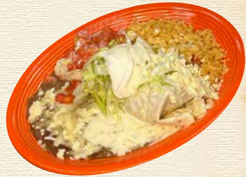
FAJITA BURRITO A folded flour tortilla filled with grilled chicken or steak with vegetables topped with lettuce, cheese, sour cream and tomatoes. Served with rice and beans. Cash - 12.50 Card - 13.00