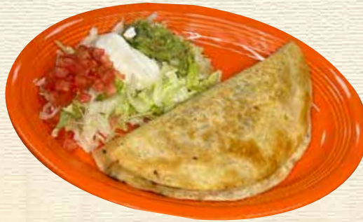
FAJITA QUESADILLA RELLENADA A folded flour tortilla filled with grilled chicken or steak, vegetables and beans. Served with lettuce, guacamole, tomatoes and sour cream. Chicken or Steak: Cash - 13.50 Card - 14.04 Shrimp: Cash - 14.25 Card - 14.82