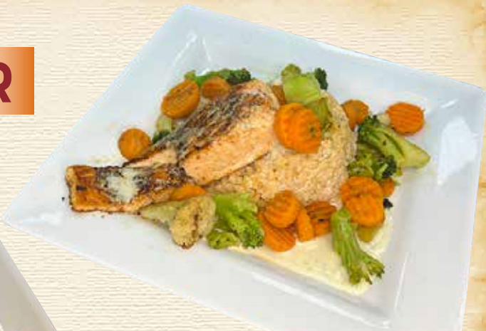
SALMON CALIFORNIA Grilled salmon served with rice and vegetables, topped with cheese dip and chipotle sauce. Cash - 12.99 Card - 13.50