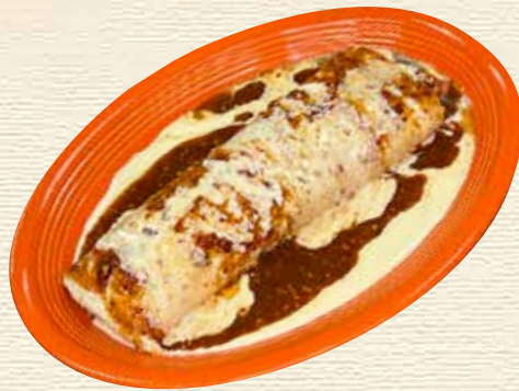
HOT BURRITO This one is hot and delicious! A burrito filled with grilled steak or chicken, refried beans, guacamole and pico de gallo. Topped with hot tomatillo sauce and cheese dip. Cash - 12.99 Card - 13.50