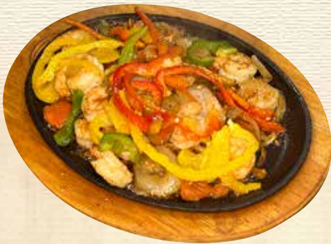
FAJITA SHRIMP Grilled shrimp with vegetables served with rice, beans, lettuce, guacamole, sour cream and pico de gallo. Cash - 16.25 Card - 16.90