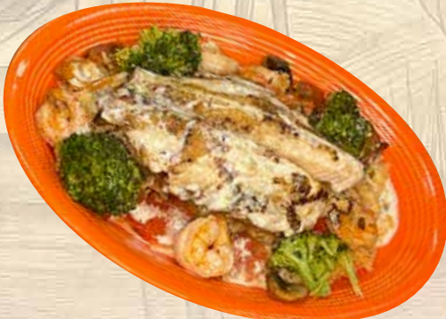
PESCADO CANCÚN This delicious combination comes with a grilled tilapia fillet over a bed of grilled vegetables, shrimp and rice. Topped with cheese dip. Cash - 16.99 Card - 17.66