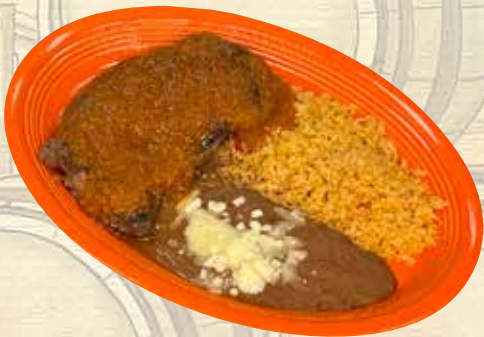
*STEAK RANCHERO Grilled beef steak topped with ranchero sauce and served with rice, beans and tortillas. Cash - 22.00 Card - 22.88