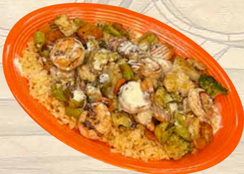
CAMARÓN ACAPULCO Grilled shrimp with broccoli, carrots and cauliflower served on a bed of rice, all topped with cheese dip. Cash - 14.50 Card - 15.08