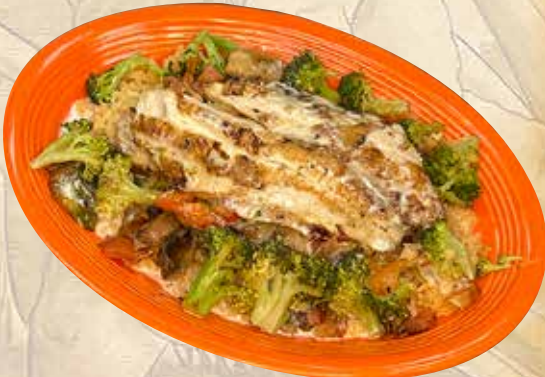
PESCADO SANTIAGO A grilled tilapia fillet on a bed of grilled vegetables and rice topped with cheese dip. Cash - 13.50 Card - 14.04

ANY SUBSTITUTIONS OF RED SALSA FOR CHEESE DIP OR EXTRA CHEESE DIP: CASH + 1.50 CARD + 1.56