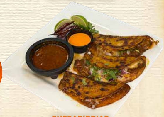
QUESABIRRIAS Three birria quesadillas with fresh onions, cilantro, hot dry pepper, lime, beef broth and sauce for dipping. Cash - 13.50 Card - 14.04