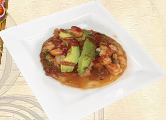
TOSTADA DE CAMARÓN A flat crispy corn tortilla topped with cooked shrimp, pico de gallo, avocado and ketchup. Cash - 6.25 Card - 6.50