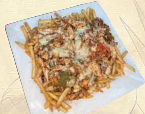
FAJITA CON PAPAS Grilled chicken or steak with grilled onions, bell peppers and tomatoes served on a bed of potato fries topped with cheese dip. Cash - 13.99 Card - 14.54