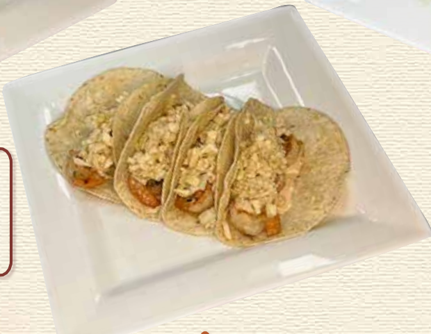
SHRIMP TACOS Four flour tortilla shrimp tacos topped with cabbage and sauce. Served with a side of rice and beans. Cash - 14.00 Card - 14.56