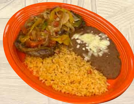
*STEAK MEXICANO Grilled beef steak topped with grilled onions, tomatoes and bell peppers. Served with rice, beans and tortillas. Cash - 22.00 Card - 22.88