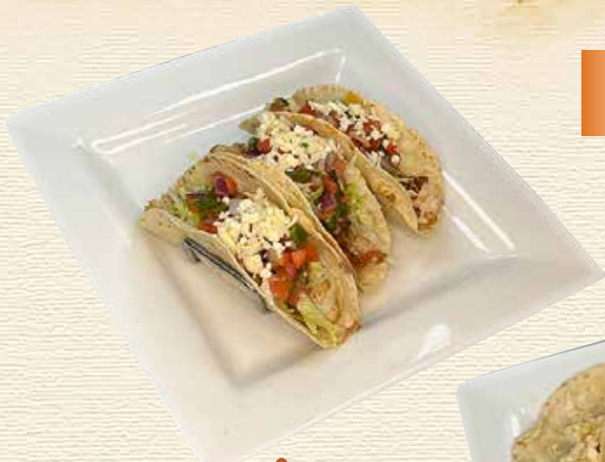
PESCADO TACOS Three soft tortilla tacos filled with grilled or fried fish, lettuce, cheese and pico de gallo. Served with rice and beans. Cash - 11.99 Card - 12.46