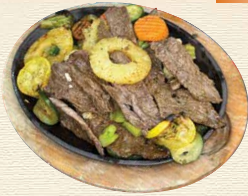
FAJITA CALABAZA Grilled steak with broccoli, cauliflower, carrots, pineapple and green and yellow zucchini. Cash - 13.99 Card - 14.54