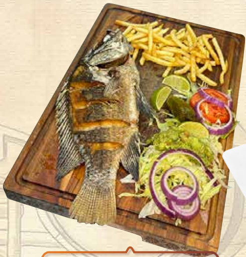
MOJARRA FRITA Deep-fried tilapia fish served with a salad, your choice of fries or rice and beans. Cash - 16.99 Card - 17.66